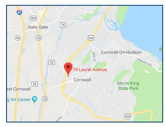
Cornwall Campus | 19 Laurel Avenue | Cornwall, NY 12518

The Montefiore St. Luke's Cornwall Center for Sleep Medicine conducts sleep testing at locations in Cornwall and Fishkill.